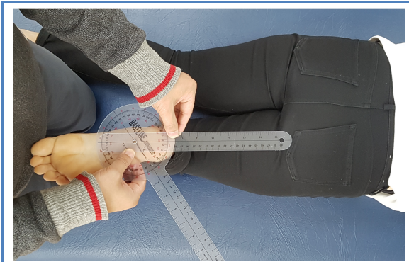
Figure 3. Measurement of tibial torsion angle.