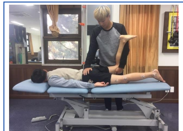
Figure 2. Iliopsoas stretching.