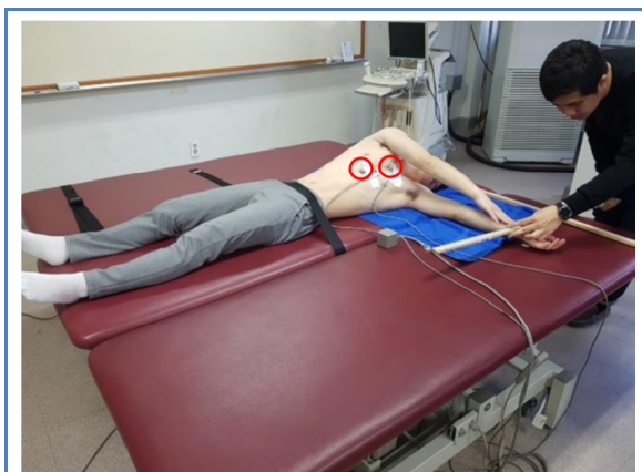
Figure 1. Sensor attachment on jugular notch and xiphoid process.

A Polhemus Liberty electromagnetic tracking system (Polhemus, Inc., Colchester, VT, USA) was used to measure the angle of axial-thoracolumbar rotation in the horizontal plane. Two sensors were attached, one at the sternum's jugular notch and the other at the sternum's xiphoid process (Figure 1). Upper and lower trunk kinematics was obtained from a global coordinate system in the horizontal plane, with zero displacement being the start position. The angles of axial-thoracolumbar rotation were defined as the absolute angle of the thoracolumbar rotation against a fixed pelvis. Kinematic data were collected at 120 Hz, and the mean value of the three trials was used for statistical analysis.